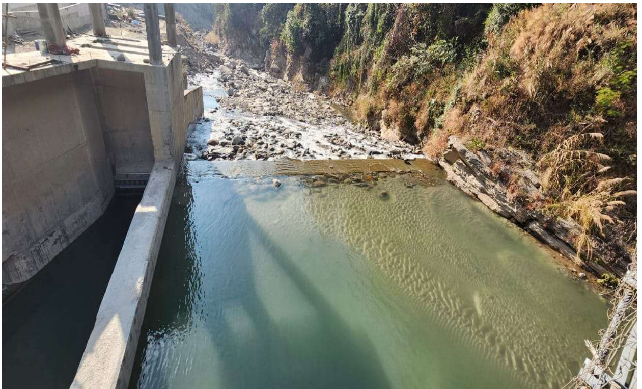
Figure 2: Weir and undersluice downstream side.