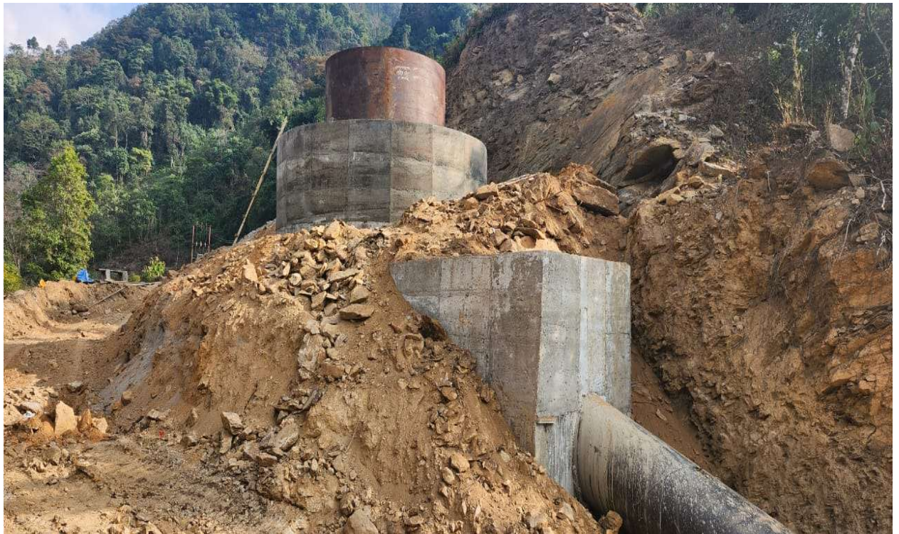
Figure 8: Surge tank civil works after completion.