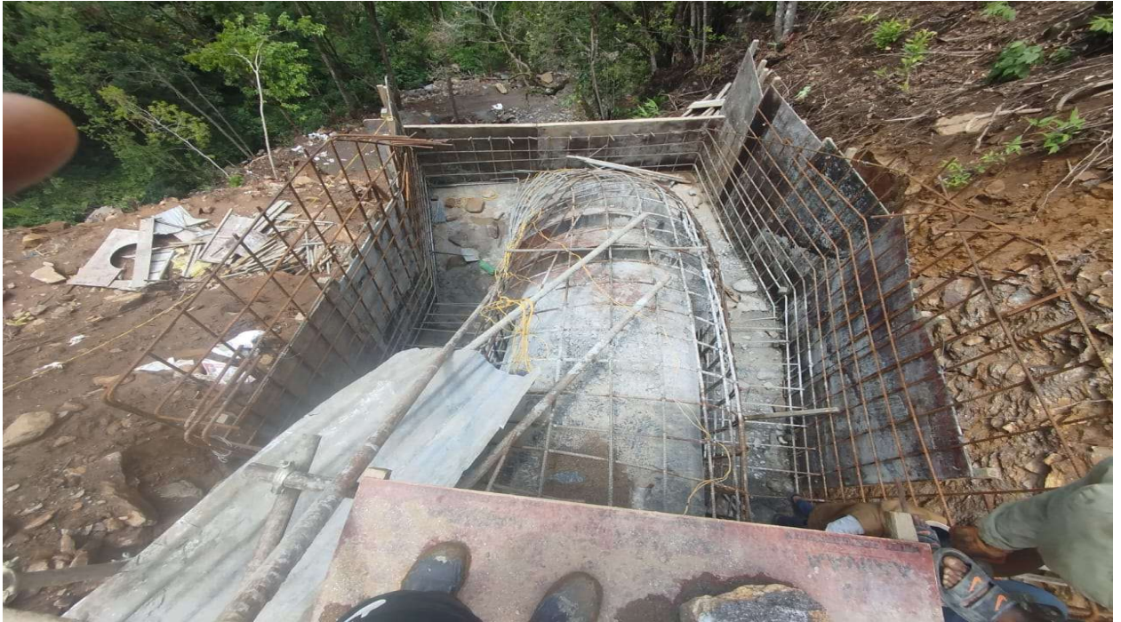
Figure 22: Installation bend and anchor block at penstock alignment.