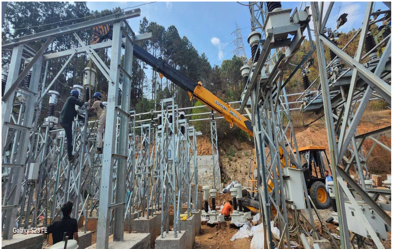
Figure 32: Substation foundation and installation work.