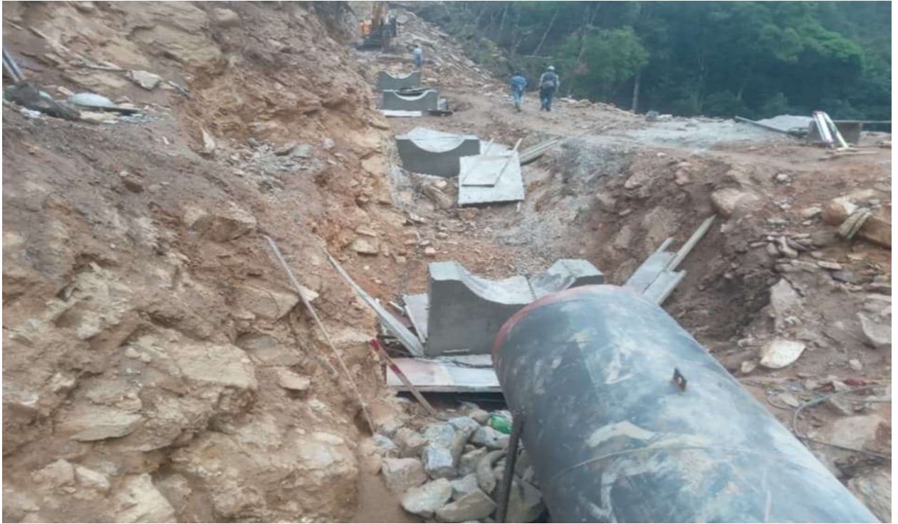
Figure 15: Saddle support construction.