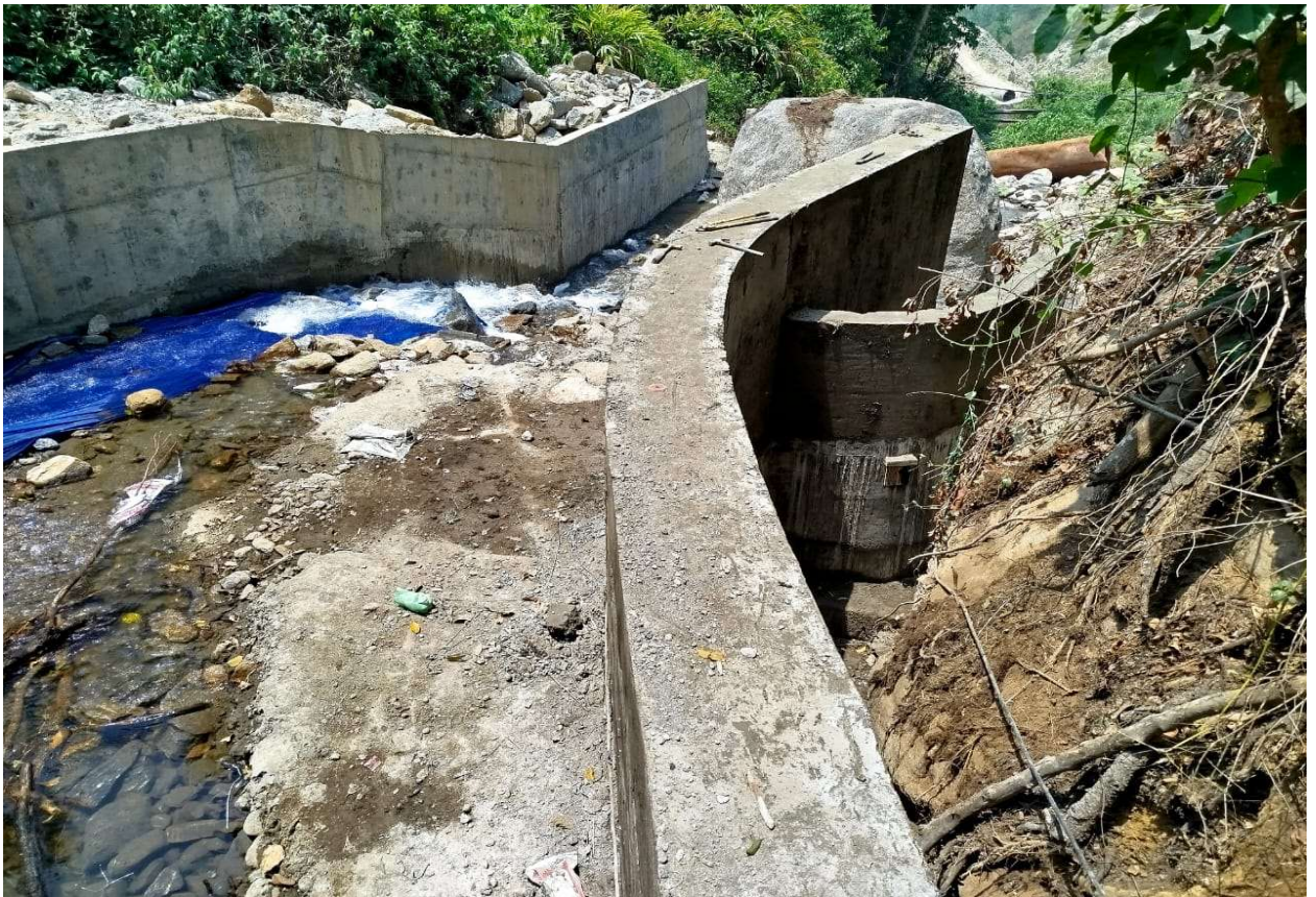
Figure 17: Construction of sikhwa headworks.