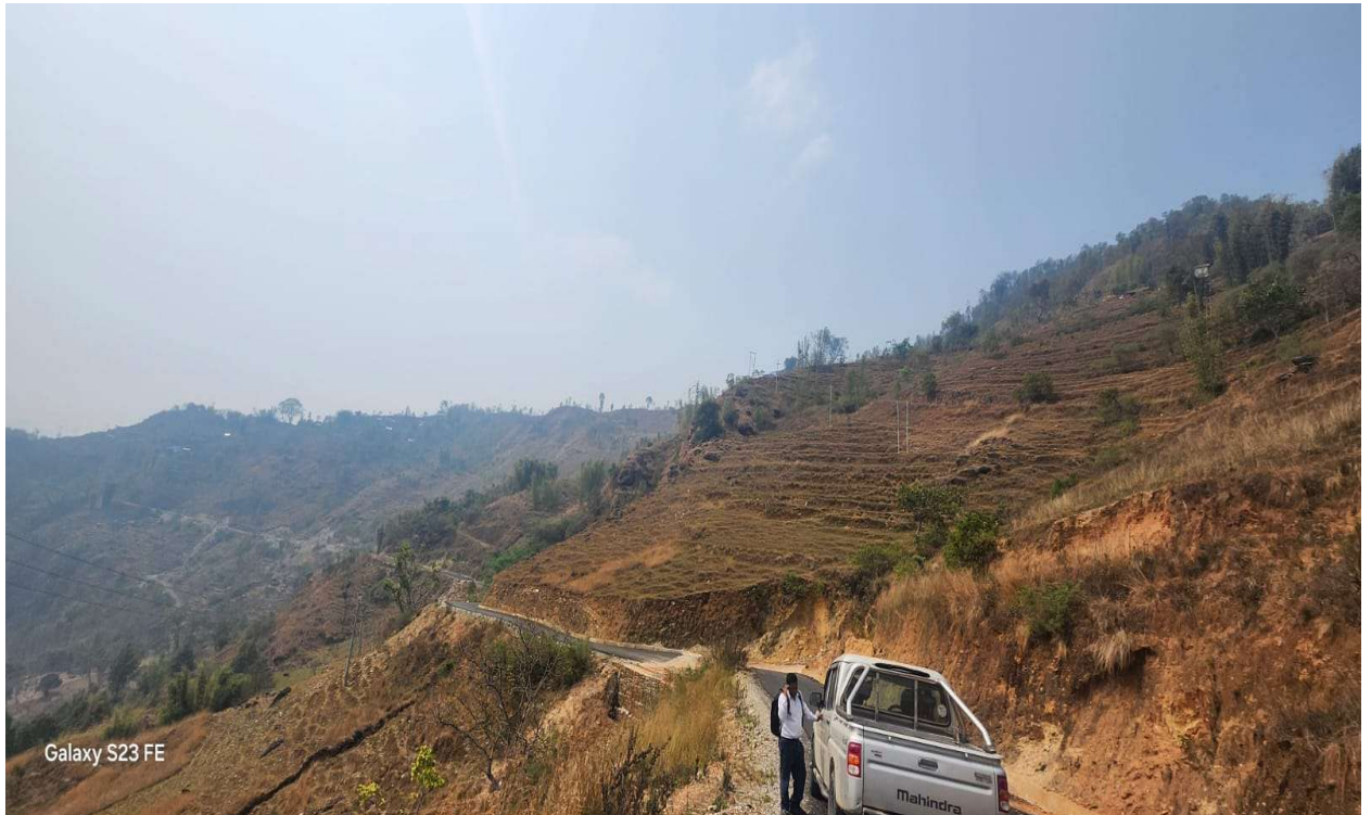
Figure 29: Transmission line construction.