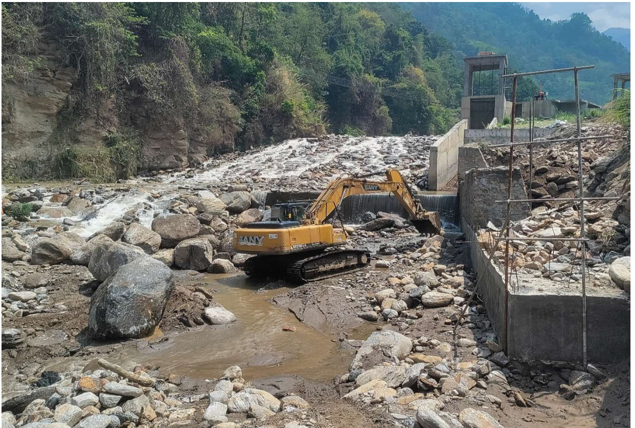
Figure 4: Downstream extra protection work..