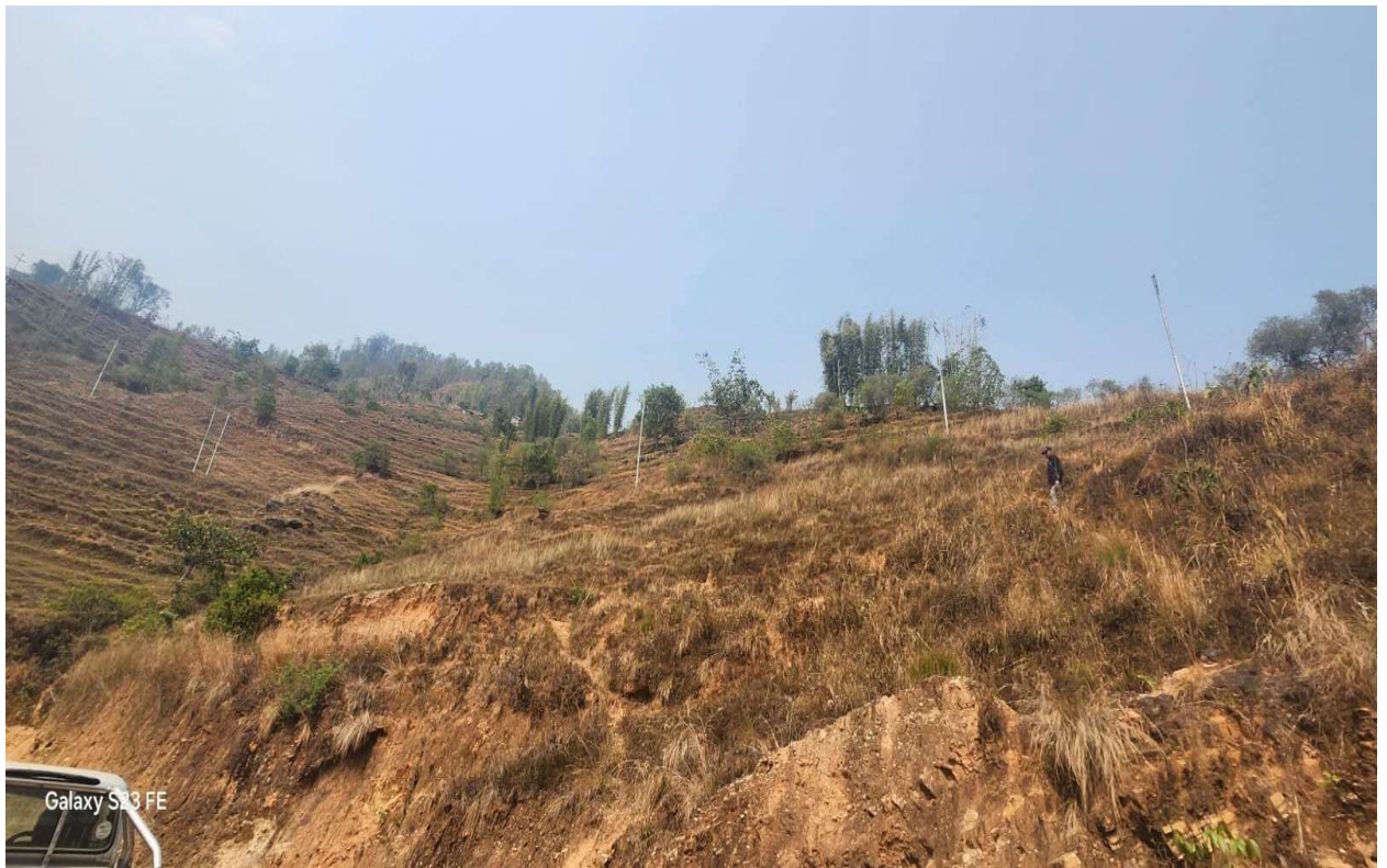
Figure 30: Transmission line construction.