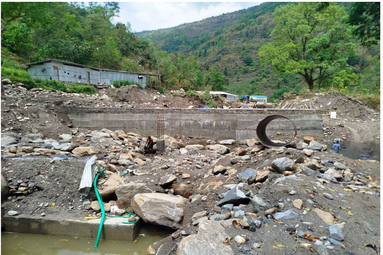
Figure 16: Lakhuwa crossing (syphon) after completion.