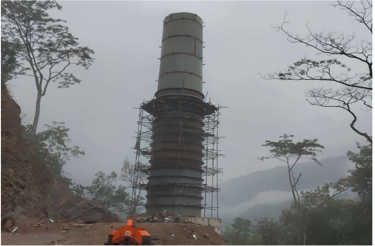
Figure 9: Surge tank after completion.