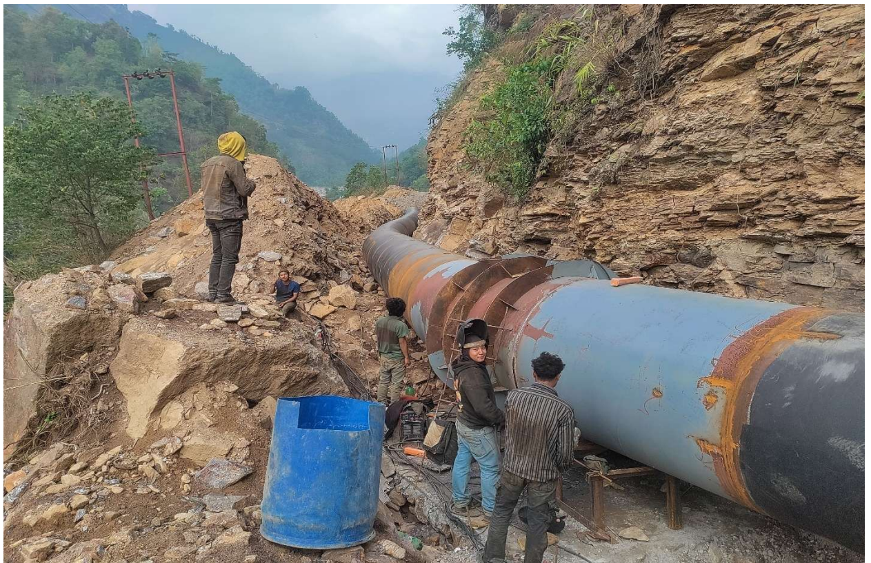
Figure 19: Headrace pipe installation around Rocky area.