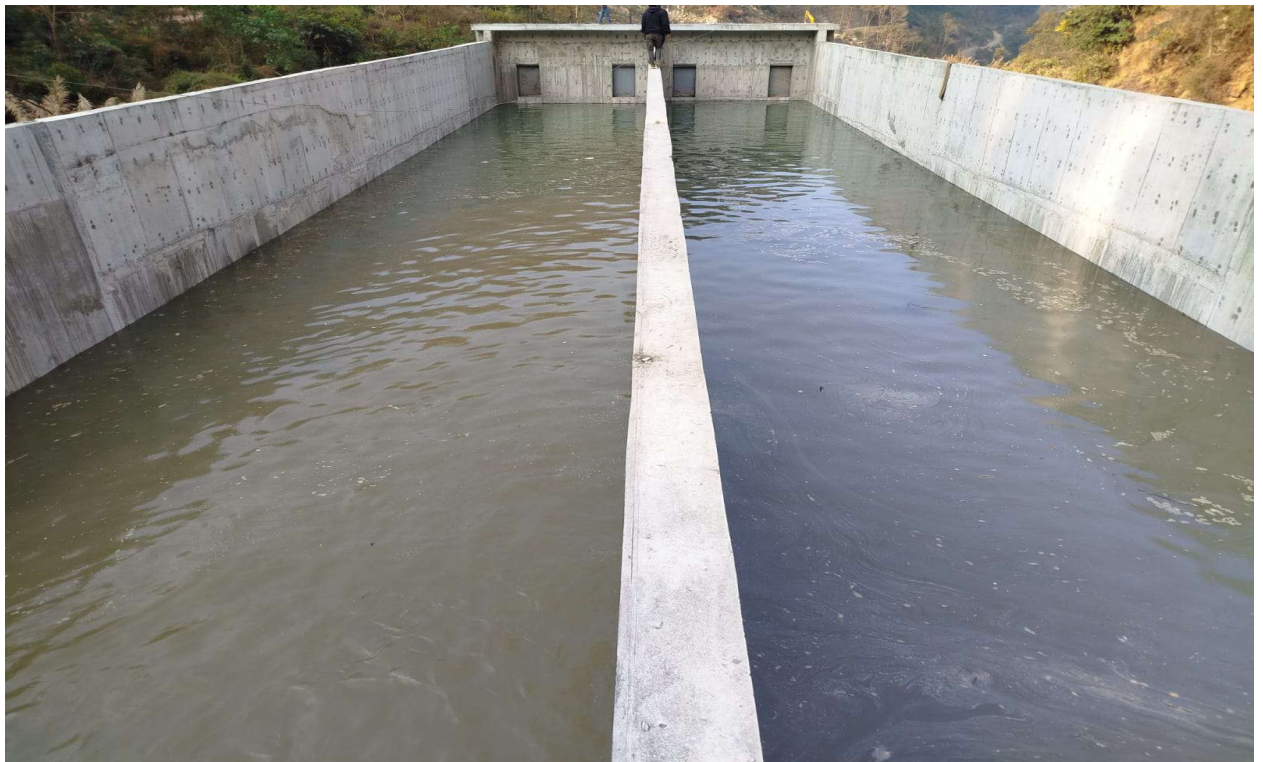
Figure 6: Settling basin after Water Filling.