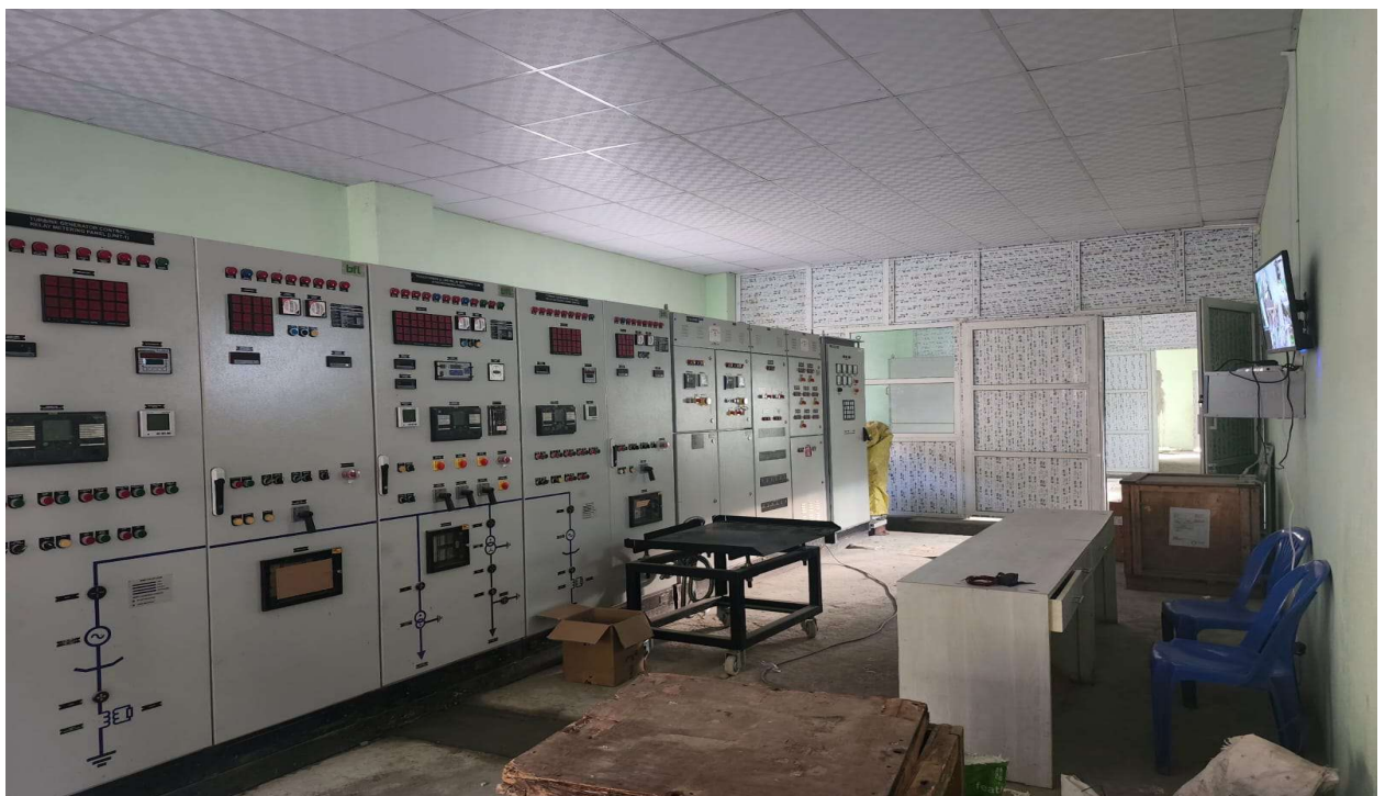
Figure 14 : Control room after panel installation.