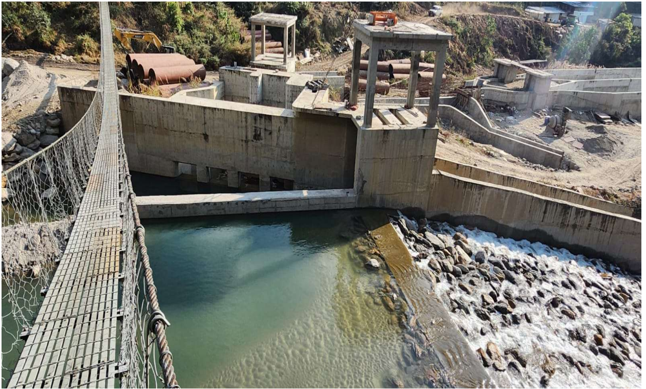
Figure 3: Intake and undersluice.