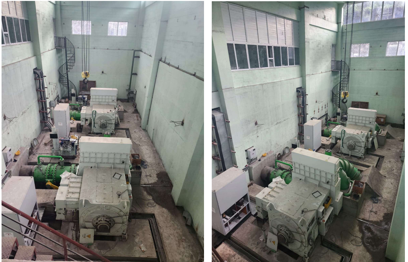
Figure 13 : Machine Installation work.