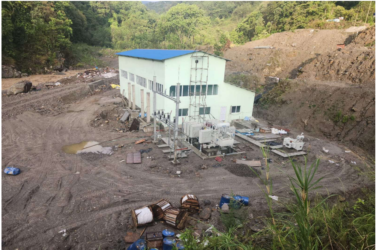
Figure 11: Transformer foundation and switchyard area after completion.