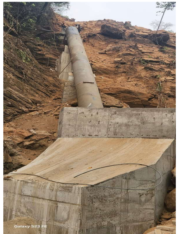
Figure 21: Installation pipe, saddle support and anchor block at vertical section.