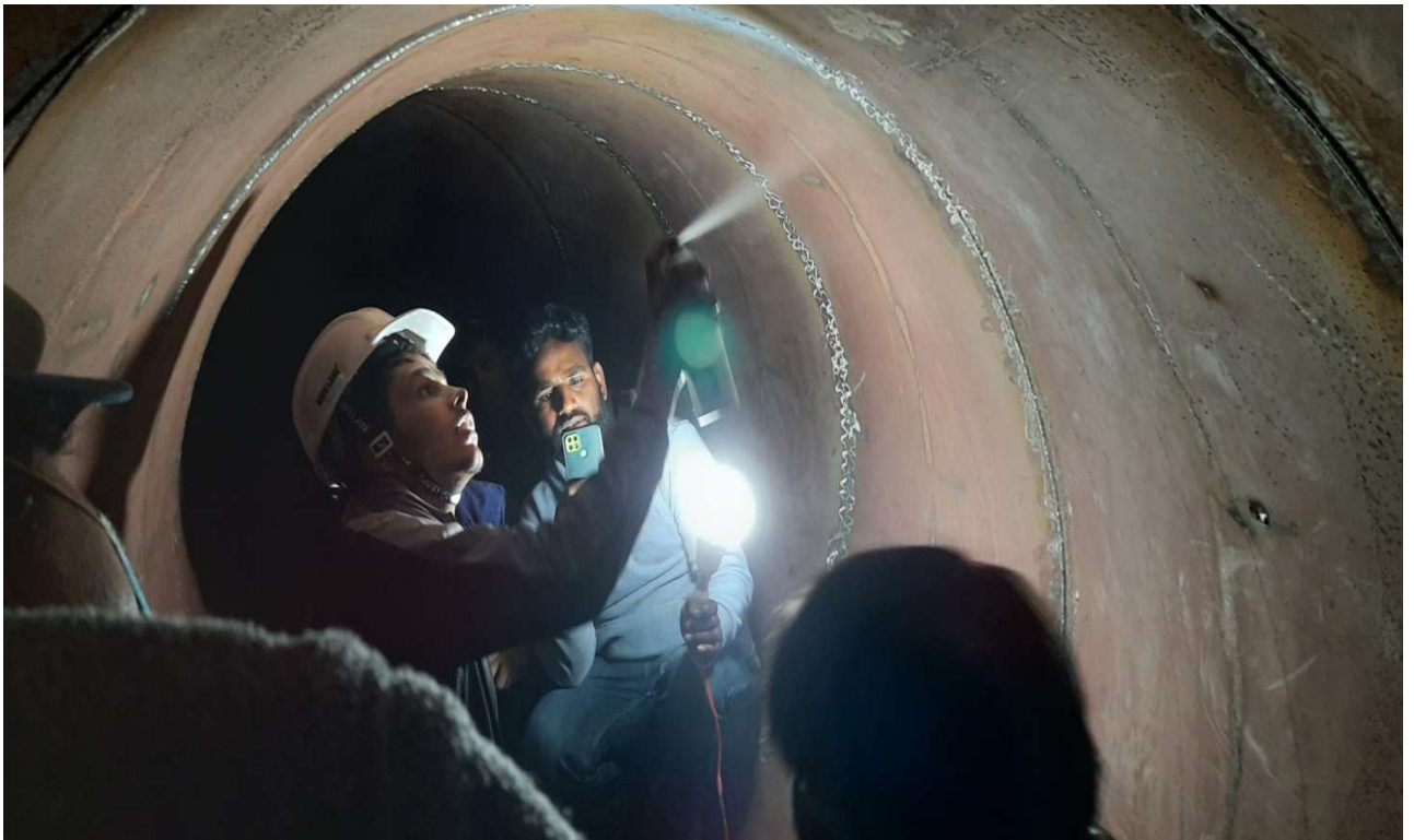
Figure 23: NDT test in pipe welding.