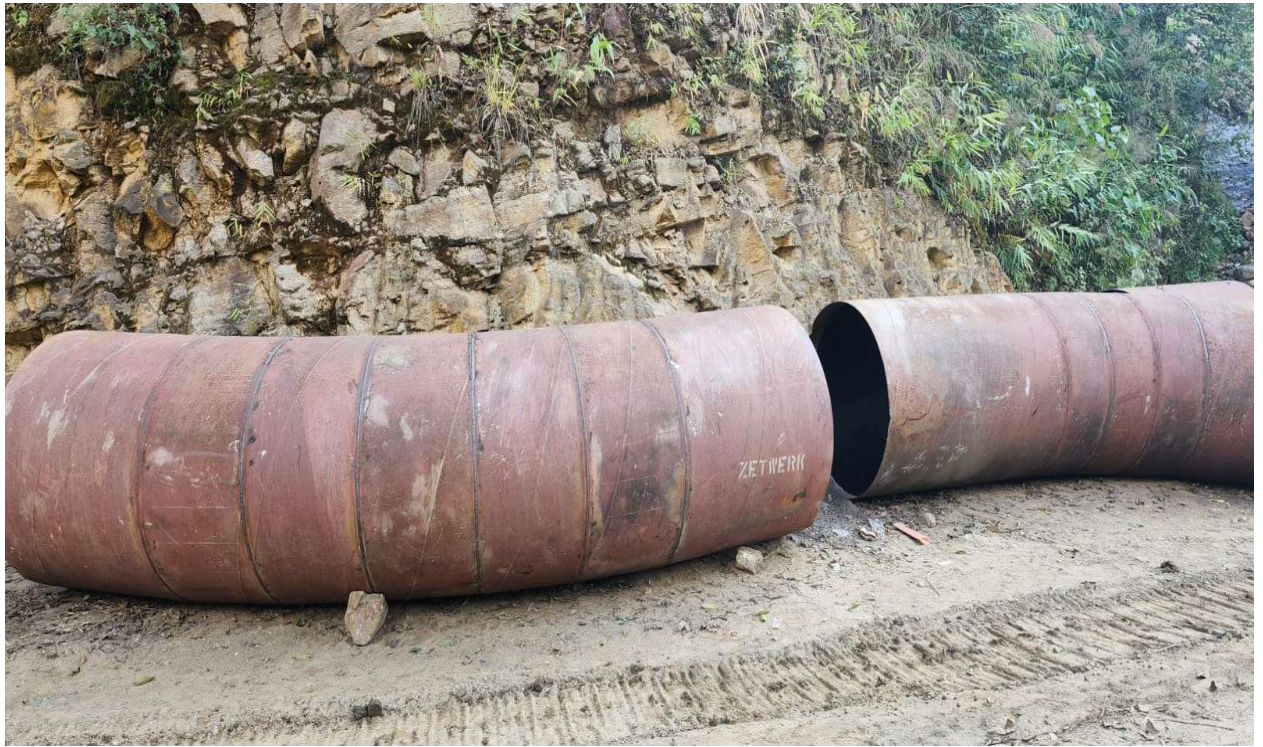
Figure 18: Bend ready for remaining Headrace alignment.