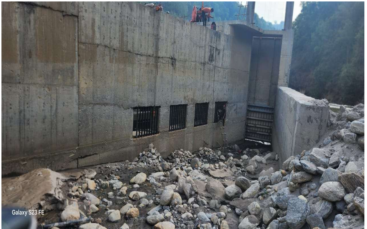
Figure 28: Trash rack installation at intake.