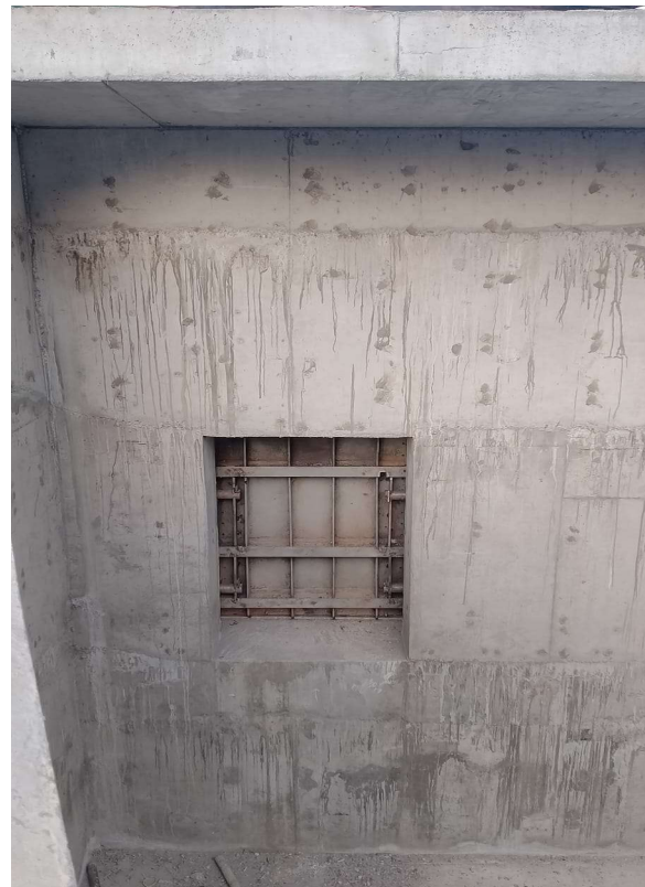
Figure 26: Gate installation work.