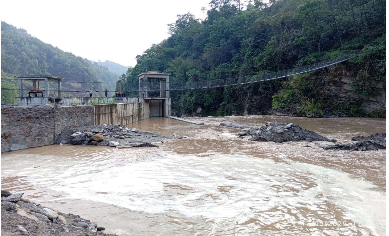
Figure 1: Overall Headworks area.