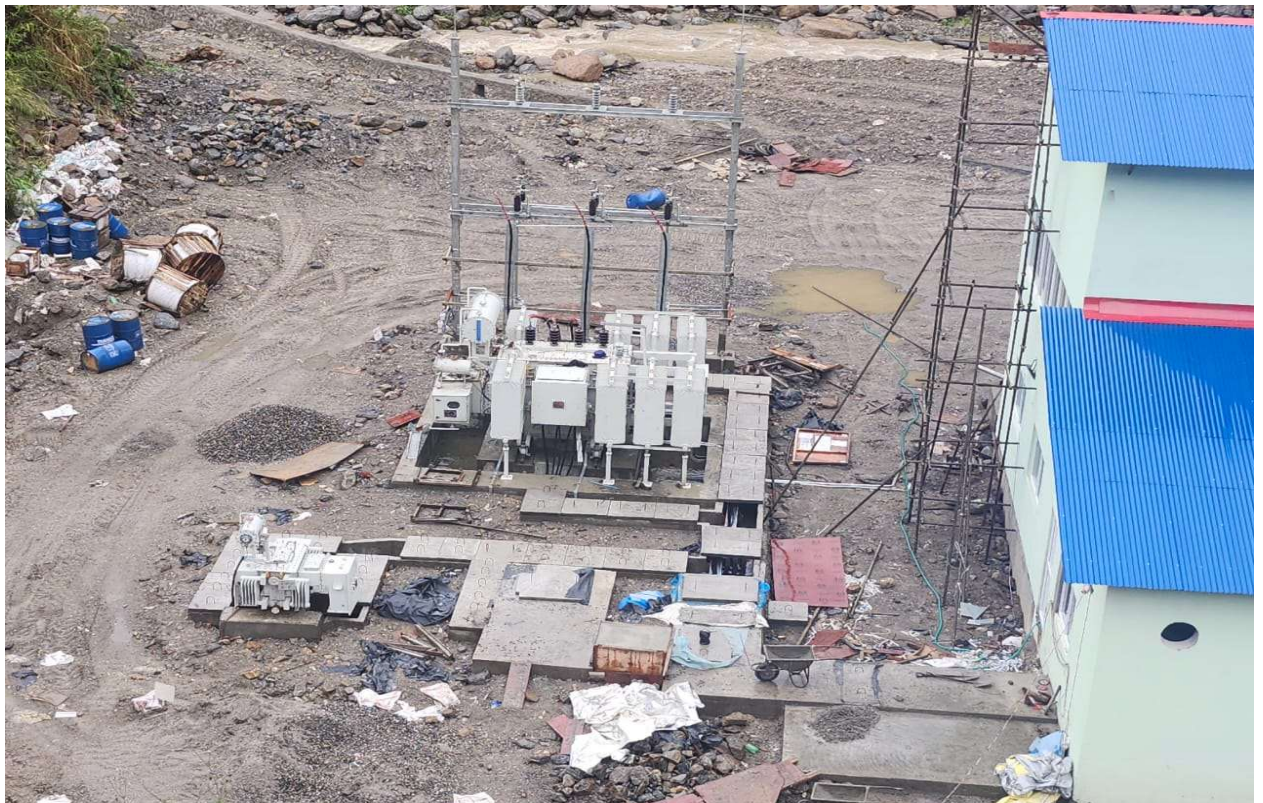
Figure 12: Transformer foundation and switchyard area after completion.