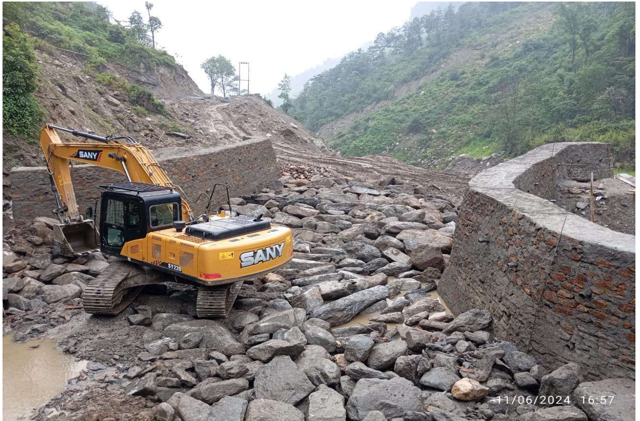
Figure 7: Syphon after final protection.