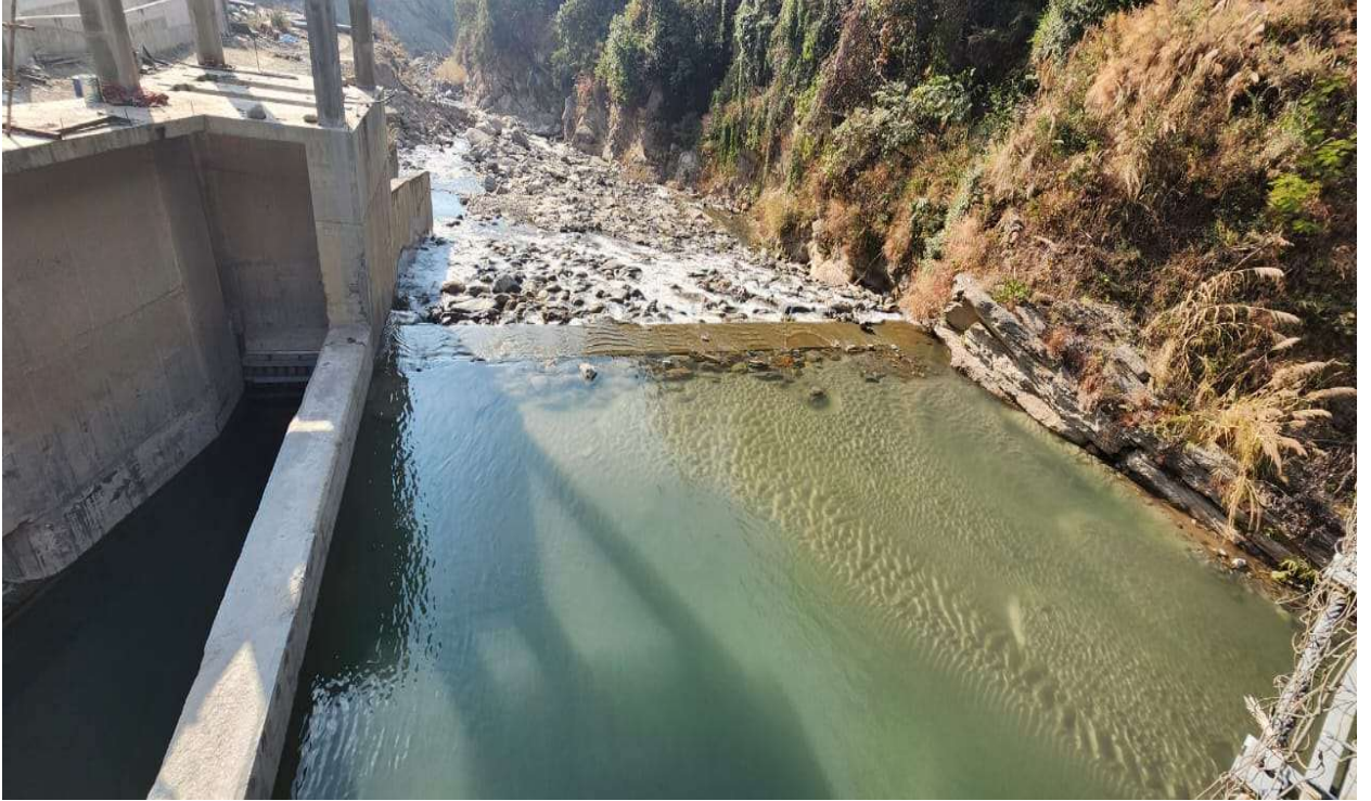
Figure 27: Water Filling after gate installation.