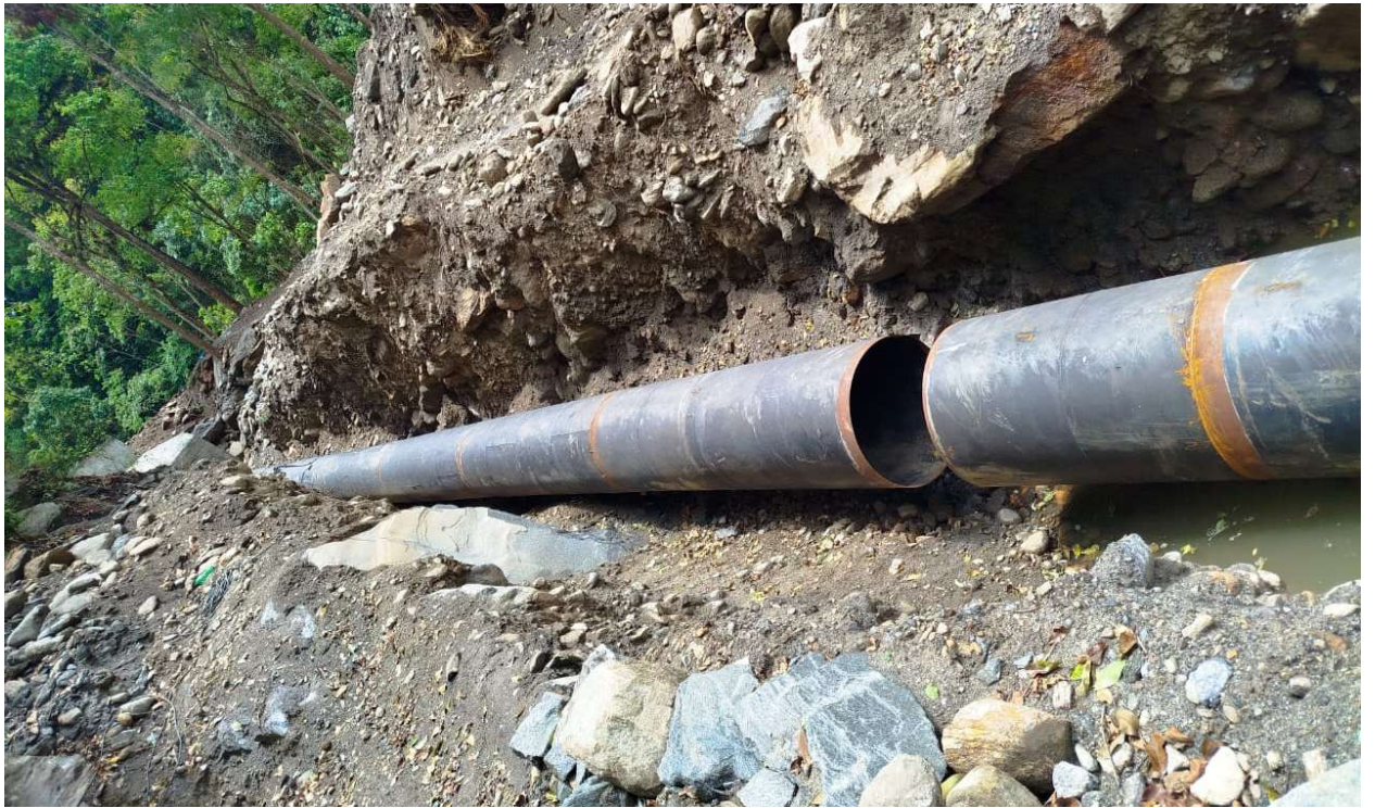
Figure 24: Pipe installation at penstock alignment.