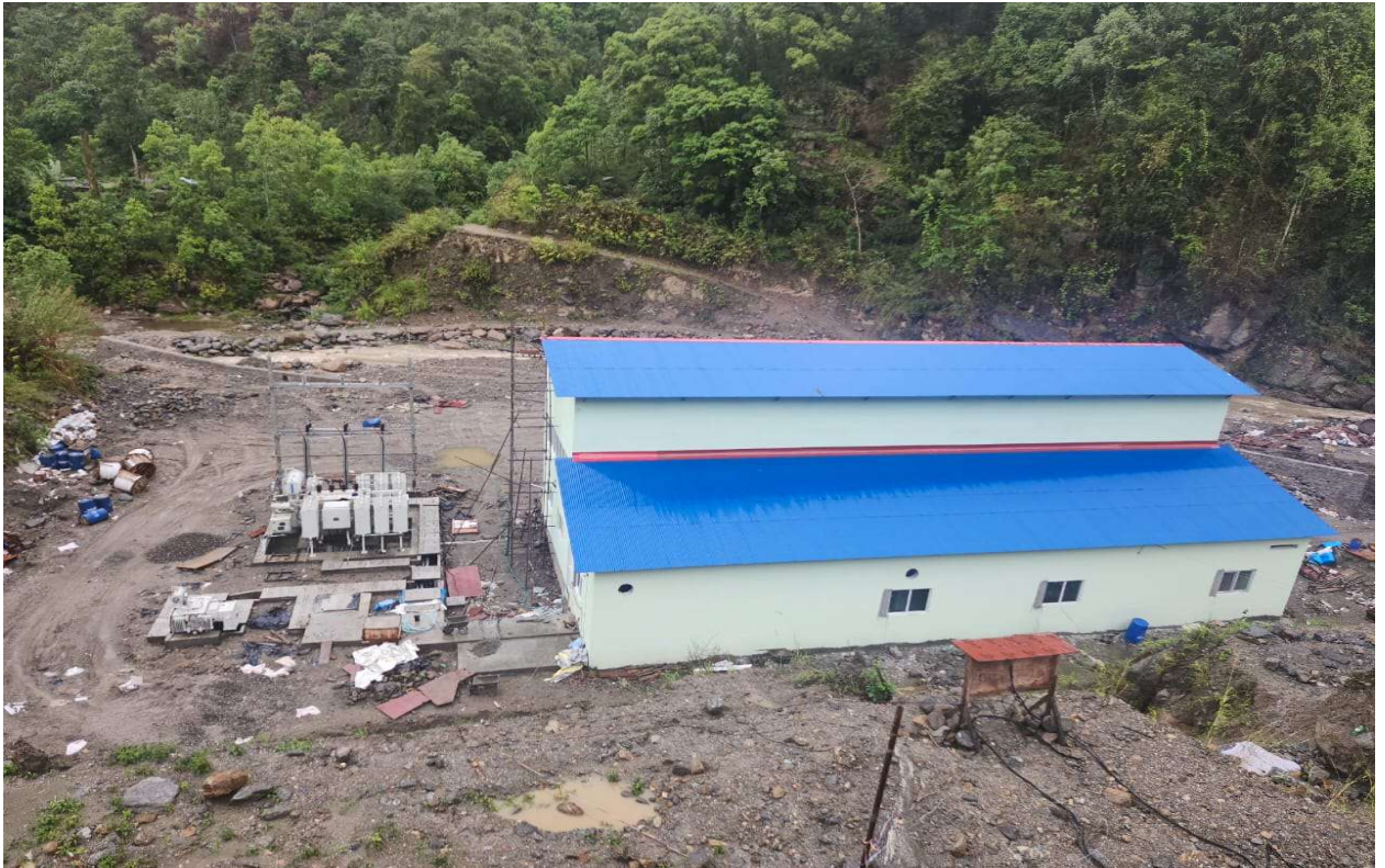
Figure 10: Overall Powerhouse area.