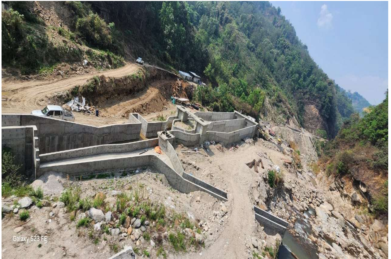
Figure 5: Gravel trap and Settling basin after completion.