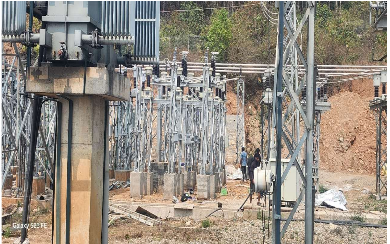
Figure 31: Substation foundation and superstructure installation work.